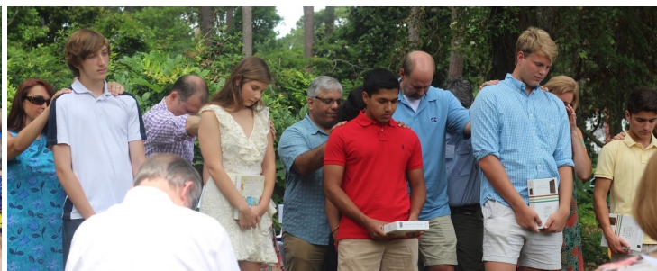
Mass on the Grass & Graduating High Schoolers being prayed for on Senior Sunday.